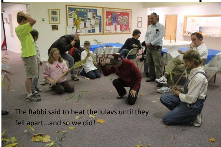
The Rabbi said to beat the lulavs until they fell apart...and so we did!