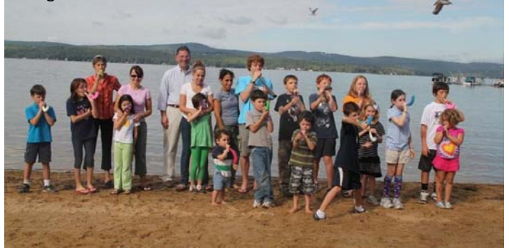
Religious School Tashlich at Bartlett Beach