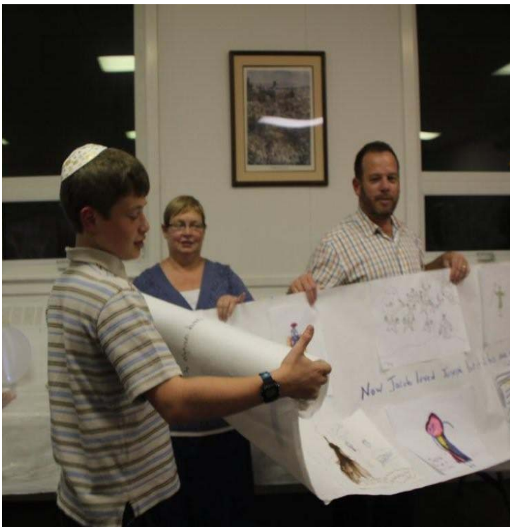
Unrolling the Religious School's Torah at